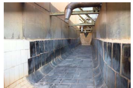
Basalt combined with Alumina Ceramic in a Sugar Beet trough