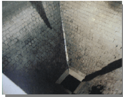
A Power Station Coal Bunker completely lined in cast basalt tiles

Compared with chutes of mild steel or other metal construction, where the steel suffers from corrosion as well as abrasion, experience has shown that basalt tiles would last at least 15 times the life of an unprotected chute.